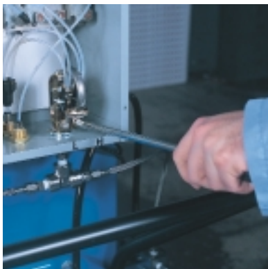
Easy to install right out of the box with simple adjustments, Binks Equalizer™ Systems are also low maintenance.