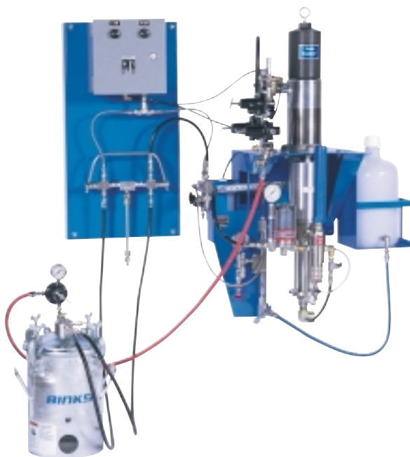
Binks Equalizer™ Wall Mount System with Comet 3-C Pump, 109-1115.