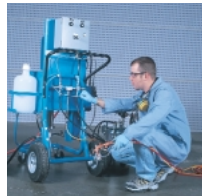
One-step flushing is quick and easy and uses less solvent than other tanks.