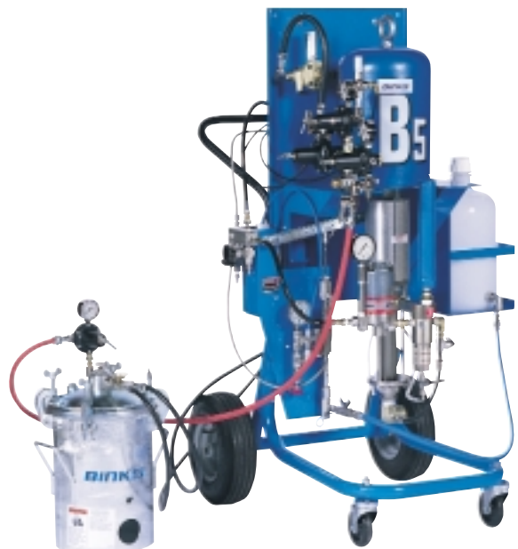
Binks Equalizer™ Cart Mount System with B5-D Pump, 109-1118.