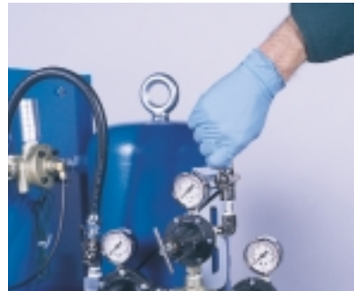
Binks Equalizer™ Systems offer precise pressure control.

In addition, Binks Equalizer™ Systems include a panel mounted pneumatic catalyst alarm and mix manifold, ratio check assembly, and base material recirculation capability to assure optimal pressures and safety.