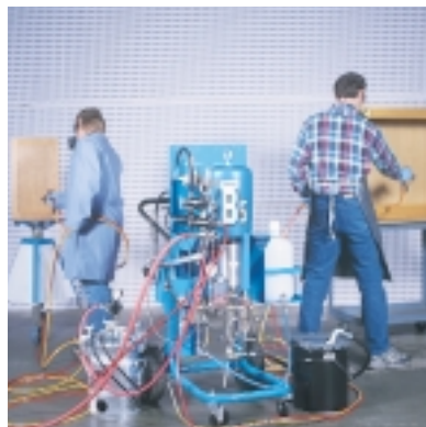
Binks Equalizer™ Systems are simple, reliable and powerful enough to supply more than one gun, when needed.