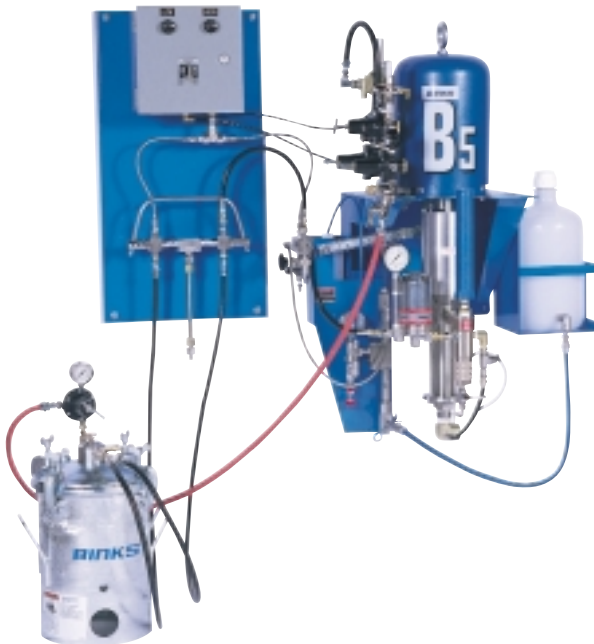
Binks Equalizer™ Wall Mount System with B5-D Pump, 109-1116.