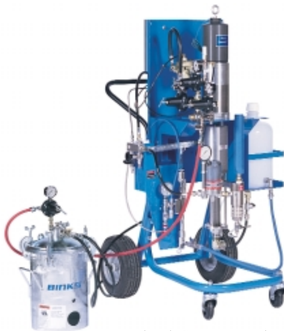
Binks Equalizer™ Cart Mount System with Comet 3-C Pump, 109-1117.