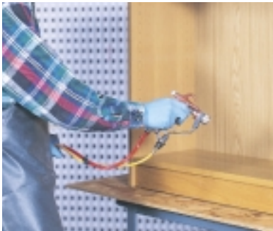
Binks Equalizer™ assures consistent sheen and texture.

Frustrated by unreliable systems to pump, meter, and mix catalyzed wash coats, sealers, and top coats? The new Binks Equalizer™ Systems are designed for accurate, high performance and easy maintenance with each application. Ideal for both air assisted and low pressure 1,000 psi ( 68 bar ) airless applications, Binks Equalizer™ Systems offer maximum functionality in low-to-high production environments manufacturing wood cabinets, office furniture, and institutional/restaurant/bar furniture.